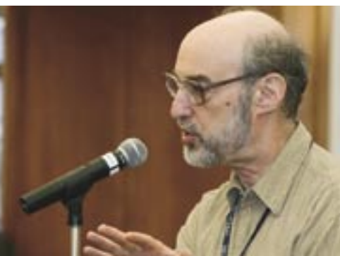
(Below) Audience members played an active part in discussions at all Weekend panels.