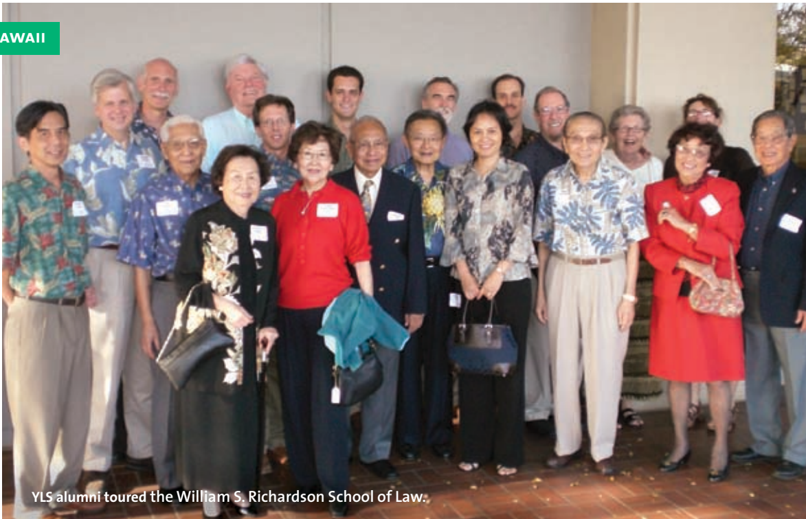
YLS alumni toured the William S. Richardson School of Law.