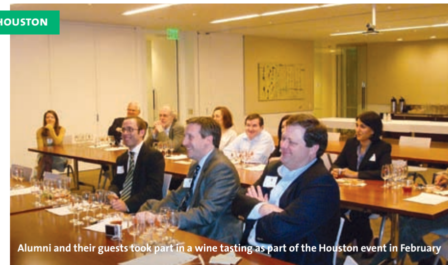
Alumni and their guests took part in a wine tasting as part of the Houston event in February