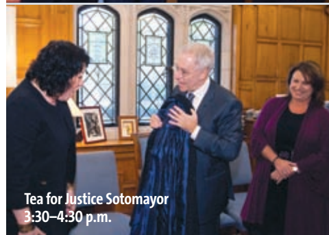
Tea for Justice Sotomayor 3:30–4:30 p.m.