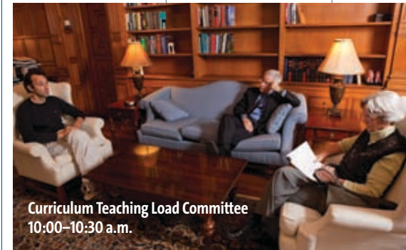
Curriculum Teaching Load Committee 10:00–10:30 a.m.