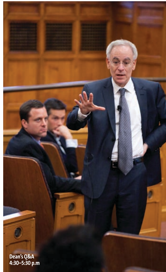
Dean's Q&A 4:30–5:30 p.m.