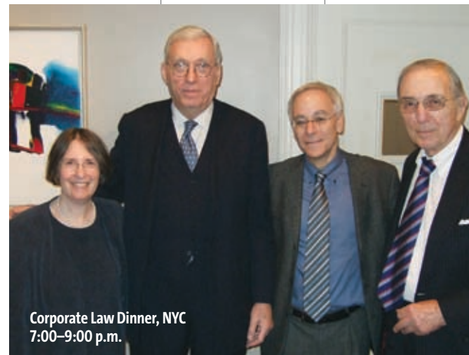
Corporate Law Dinner, NYC 7:00–9:00 p.m.