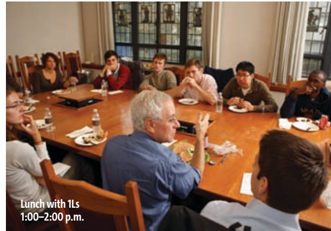
Lunch with 1Ls 1:00–2:00 p.m.