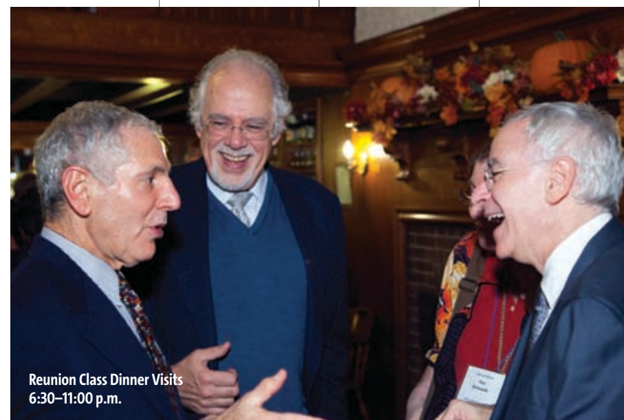
Reunion Class Dinner Visits 6:30–11:00 p.m.