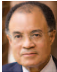
Drew S. Days III