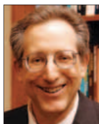
Jack M. Balkin