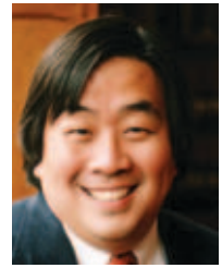
Harold Hongju Koh