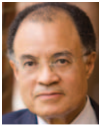
Drew S. Days III