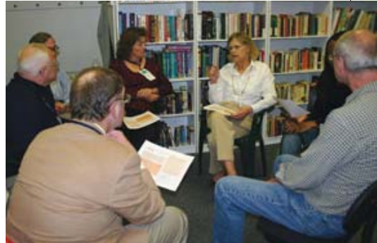
The Class of 1976 ventured to nearby "New Haven Reads" to volunteer for an afternoon of service.