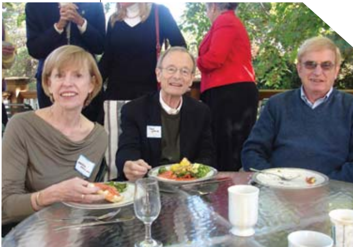
Sunday brunches hosted by faculty members and graduates gave another opportunity to visit with classmates.

Videos and photos of selected Alumni Weekend events are now available online at www.law.yale.edu/alumni/AlumniWeekend.htm