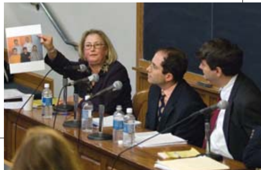
The Class of 1956 gathered for a symposium on "Guantanamo Detainees: Breakdown of the Separation of Powers?"