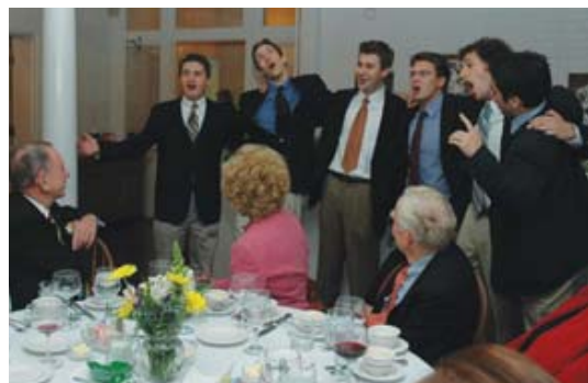
Class receptions and dinners were held at restaurants throughout New Haven. Six Angry Men, the Law School's newest a cappella group, sang at several of the dinners.