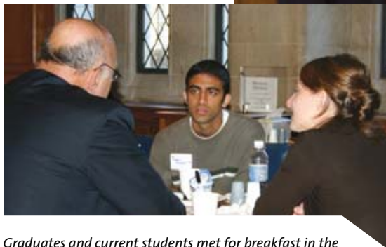
Graduates and current students met for breakfast in the Law School dining hall on Saturday morning. Alumni could choose to mingle with their classmates and/or be matched with current students to talk about common interests.