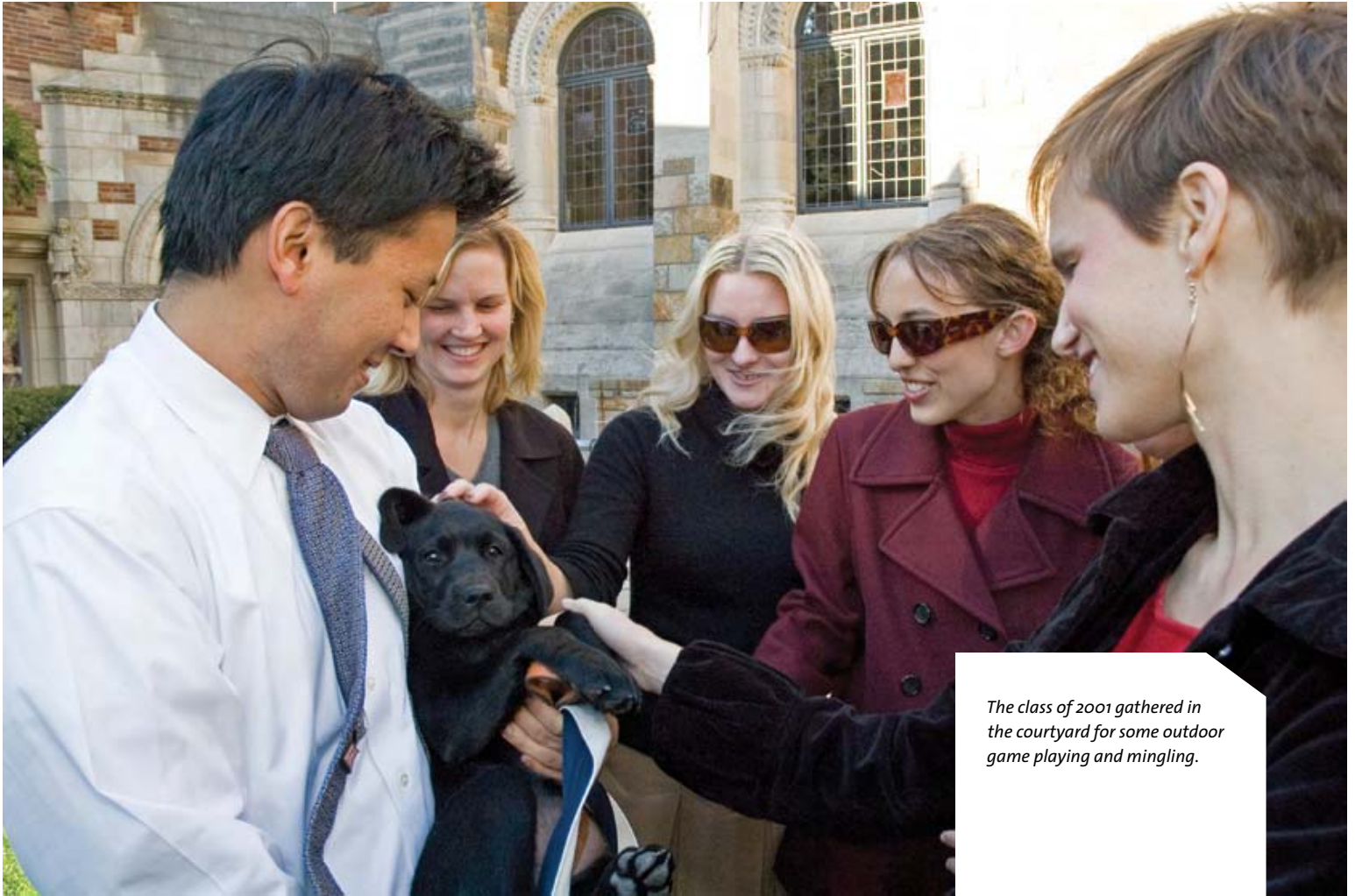
The class of 2001 gathered in the courtyard for some outdoor game playing and mingling.