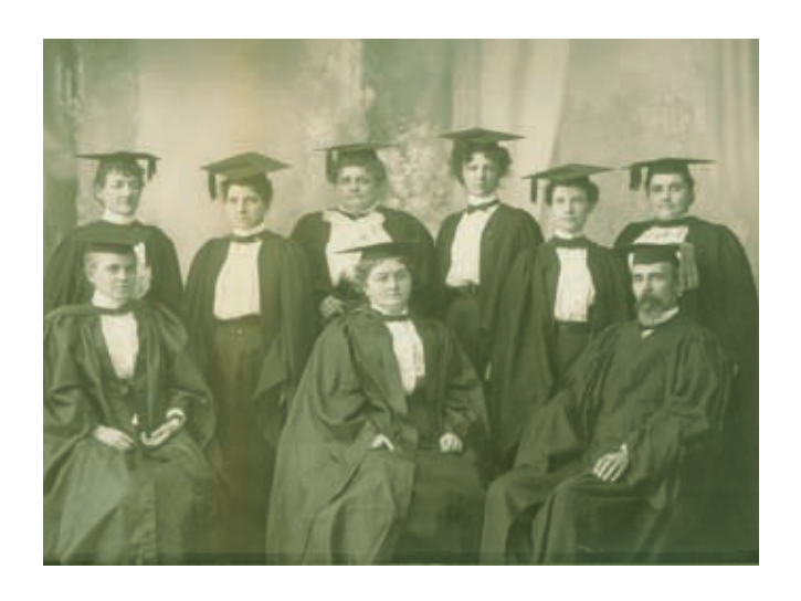
Legal Education for Women. Efforts to open legal education to women in the late nineteenth century led to the creation of law schools prevailingly for women, including Washington College of Law (today, the law school of American University in Washington, D.C.), whose first graduating class is shown in this photograph from

Yale Law School (this portrait hangs in the Law School's Room 127).