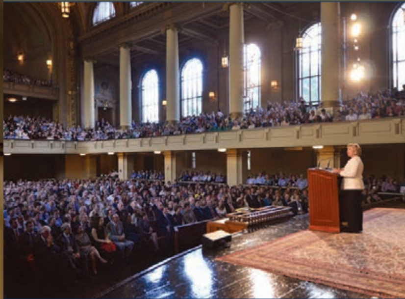
Former Secretary of State Hillary Clinton '73 was awarded the Award of Merit and gave remarks on the importance of early childhood education to a full house at Woolsey Hall as part of the 2013 Alumni Weekend (see page 2).