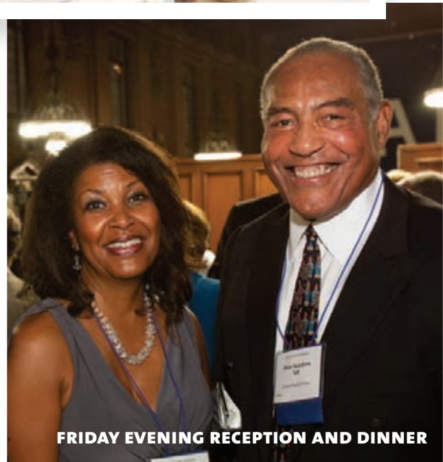
FRIDAY EVENING RECEPTION AND DINNER

The quotes that follow give a sense of the formal discussions that took place during the weekend.