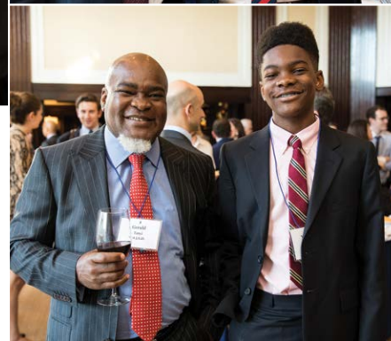
DC Dinner